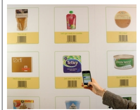
Figure 3. Ocado virtual shop at London's One New Change shopping centre

Window shopping at Ocado's virtual store